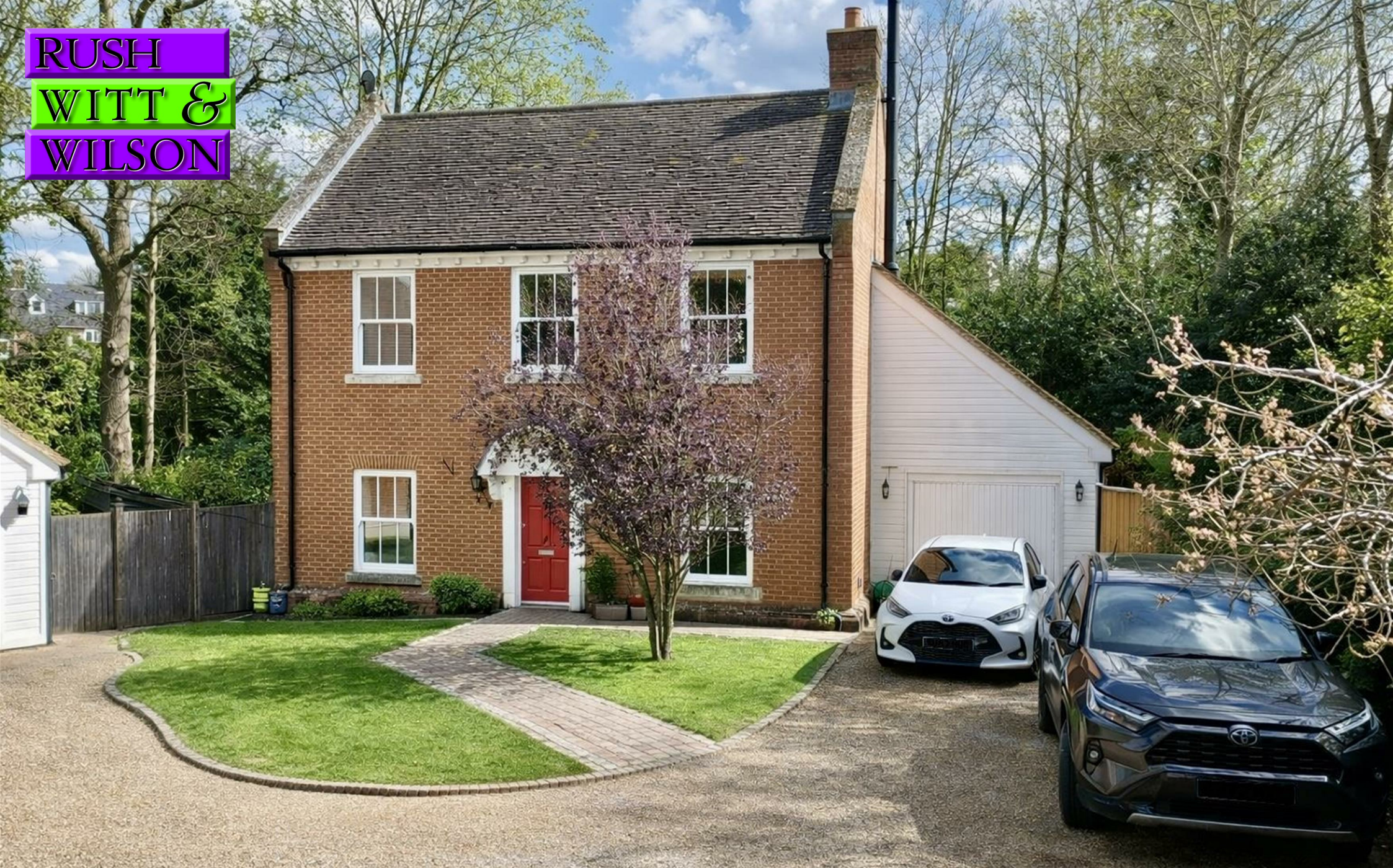
Ivy House, Oakfield, Hawkhurst, Kent, TN18 4JR. £625,000 Freehold